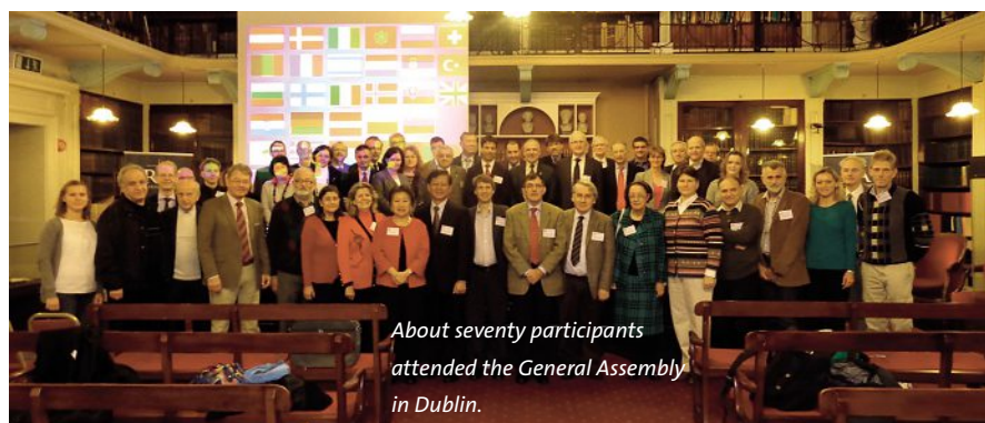
About seventy participants attended the General Assembly in Dublin.