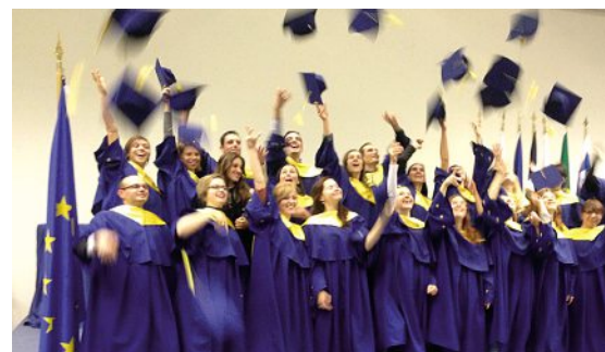
More than 30 students were awarded their diploma supplement for the Euromaster.