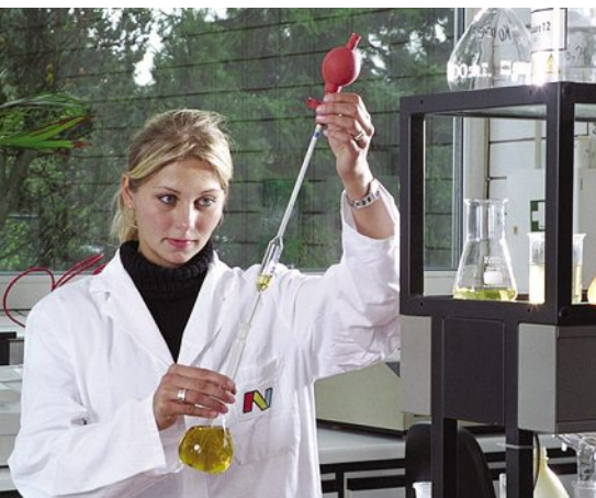
Working in the lab: Mismatch between industry requirements and taught courses.

Two thirds of chemical companies currently have difficulty in filling vacancies. Some shortages arise from a mismatch between the requirements of industry and taught courses, e.g. academia focuses on synthetic chemistry but 40 percent of EU chemical production involves formulation chemistry.