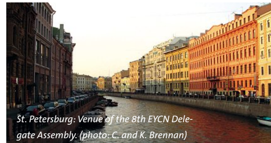
St. Petersburg: Venue of the 8th EYCN Delegates Assembly.