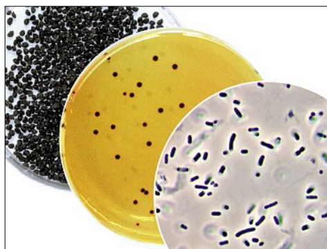
Onion seeds, agar plate with colonies of Salmonella sp. isolated thereof and single Salmonella cells under the microscope (from left to right).

sound (HIFU) and subsequent nano-LC separation of resulting peptides. The latter are subsequently identified by MALDI-TOF/TOF mass spectrometry. The use of peptides as biomarkers extends the usable mass range and type of