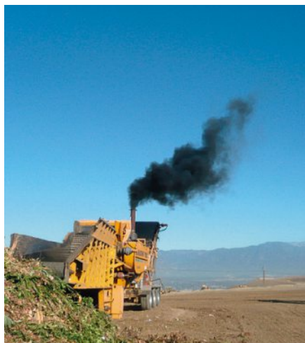
Fig. 1. Construction machinery in Switzerland has to be equipped with filters since 2009, but most trucks on roads are not.

The endeavor 'NEAT' (Neue Alpentransversale, the new transalpine rail link) triggered various activities, among them the VERT project (Verminderung der Emissionen von Realmaschinen im Tunnelbau) – a joint effort from SUVA, BAFU, filter and catalyst manufacturers, TTM, and EMPA – to evaluate suitable filter technology for construction machinery to fulfill air quality standards in these long tunnels (Fig. 1).