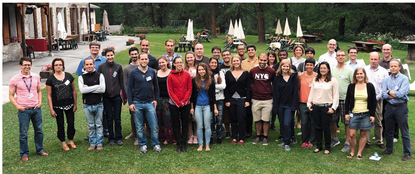
Swiss Summer School participants outside the Hotel Kurhaus, Arolla