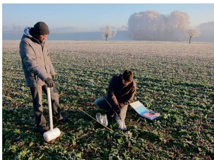
Sampling of arable soil for U isotope analysis.

We also analysed the speciation of mercury (Hg) in a contaminated agricultural floodplain in Valais, by coupling HPLC to ICP-MS. We developed and validated a new method to easily screen soils, biota and sediments for methylmercury (MeHg)