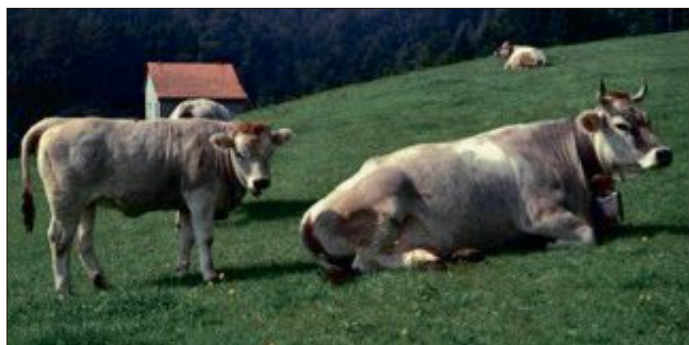
Alpine cattle economy.

To investigate early cattle husbandry and animal mobility in the Neolithic wetland sites of Switzerland, we applied strontium isotope analysis ( ^{87}\text{Sr}/^{86}\text{Sr} ) to solid tooth enamel samples. The ^{87}\text{Sr}/^{86}\text{Sr} ratios in the tooth material reflect the ^{87}\text{Sr}/^{86}\text{Sr} of the geological environment and feeding grounds during different life periods of individual cattle. In order to obtain samples at the spatial and hence temporal resolution required to identify seasonal movements of cattle, we employed laser ablation (LA) inductively coupled plasma mass spectrometry (ICP-MS). A homogenized Ar-F 213nm laser with a spot size of 120 \mu\text{m} , fired at 10 Hz, is focused on the sample, which is then ablated continuously, while it is moved in the growth axis of the tooth. The ejecta are swept into the MS, where the Sr isotope ratio ( ^{87}\text{Sr}/^{86}\text{Sr} ) is determined.