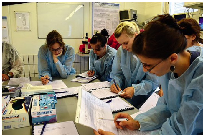
ZHAW Wädenswil Summer School. Summer school students in the laboratory. The practical work included recording and discussing the results generated by experiments.