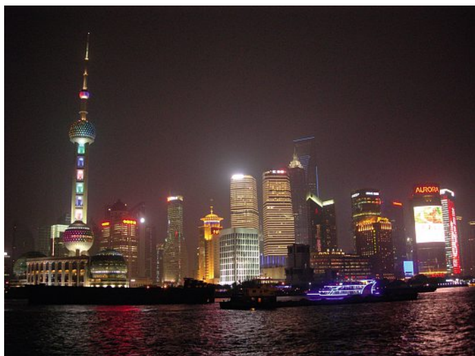
The Chinese government has an aggressive policy of promoting biotechnology, particularly in Beijing and Shanghai (pictured). Large amounts are being invested in genome research and China is the world leader in bioethanol.

supplies start-up companies with promising products with the required infrastructure and the laboratory environment they need for their activities completely free of charge for a year. At the other end of the scale, the Swiss visitors watched a large number of young people – mainly women – at a testing facility roughly comparable to Empa performing a variety of quality control tasks, such as checking, weighing and cutting goods to size, in narrow cubicles measuring just 50 × 50 cm. Most of them did not leave the workplace to eat their lunch and also had a short sleep there. It was not possible to find out what level of education these people had, but it is evidently fairly difficult to keep well-trained people on board.