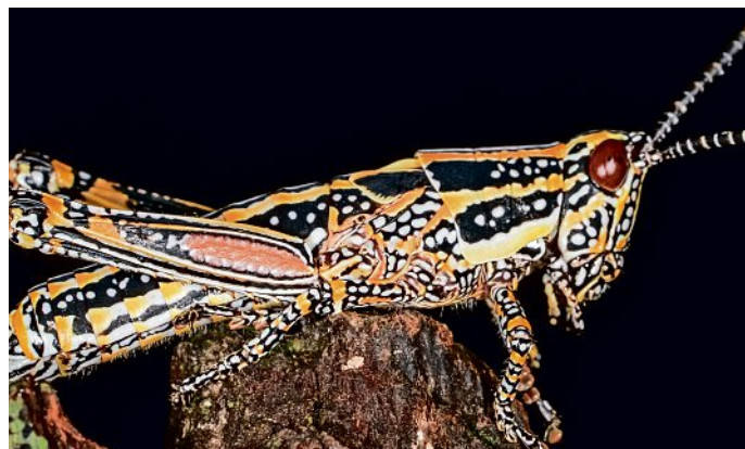
Fig. 2. Juvenile elegant grasshopper ( Z. elegans ).

In pyrrolizidine alkaloids [2,3] (Fig. 3), the nitrogen-heterocycle is bicyclic as exemplified by the alkaloids heliotrine and senecionine (Fig. 3), both of which are ingested by Z. elegans . It is not by accident that Z. elegans encounters plants containing these alkaloids. These insects can detect toxins up to several metres away. One study describes Z. elegans as ‘eagerly’ trying to reach host plants,