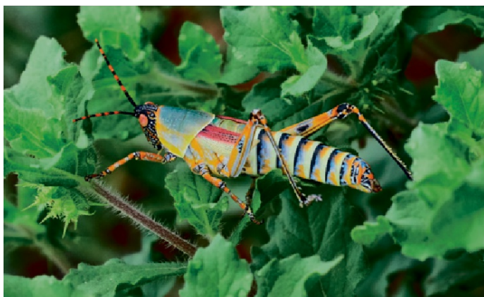
Fig. 1. The elegant grasshopper ( Zonocerus elegans ).

Elegant grasshoppers ( Zonocerus elegans ) are widespread in South Africa and easily recognized by their bright colours and bold markings (Fig. 1). Juvenile elegant grasshoppers are also strikingly marked (Fig. 2). The related variegated grasshopper ( Z. variegatus ) occurs in western and equatorial Africa and is also brightly coloured. Such coloration is often symptomatic of a chemical defense against potential predators. The association of colour with a defense strategy is known as aposematism . Z. elegans and Z. variegatus are examples of insects that have the ability to consume plants containing toxins and store the toxic compounds. For the host plants, this is somewhat ironic because they produce toxic alkaloids (which taste very bitter) to discourage herbivores from eating them.