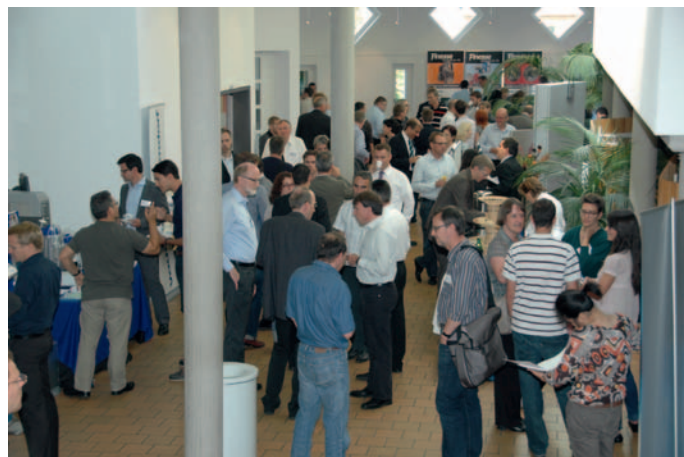
Discussions in the foyer of the Grüental Campus, ZHAW Wädenswil.

Sensors have been employed in on-line process control for many years, and reliable measurement of pH and oxygen is still absolutely crucial to bioprocess control. Although well-established methods have been in use for decades, new technologies for reliable measurement of these parameters are still being sought after. As an example, the currently available non-glass pH sensors are still limited in terms of their measuring range or robustness in harsh process environments.