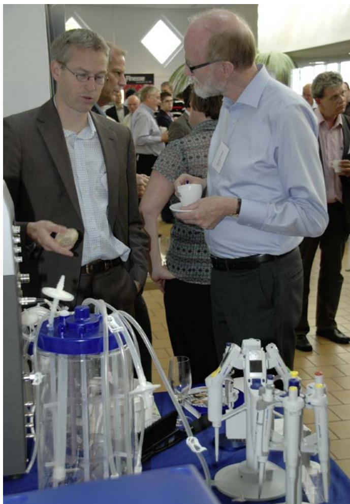
A strong focus on applications: a display of new products at the exhibition.

measurement signals to the process control system. Furthermore, they guarantee user-friendly, traceable calibration and sensor diagnostics. Holger Müller (Bluesens, Herten, D) summarized the use of gas sensors for bioprocess control: if sensors for oxygen and carbon dioxide are combined, substrate limitations may be detected and the metabolism of microorganisms or cells may be directly followed by measuring respiratory quotients.