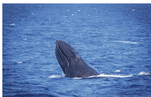
Humpback whale off Sydney Harbour.