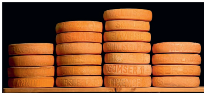
Fig. 1. Raclette du Valais AOP, a smear-ripened, full-fat semi-hard cheese made from raw milk. The cheese microbiome and thus also the quality of raw milk cheeses is influenced by environmental factors as well as manufacturing and ripening conditions.